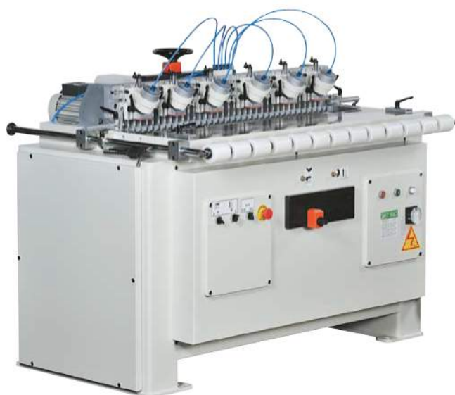
CB-70 頂板專用組合鑽 Construction Line Boring Machine for Top Panel