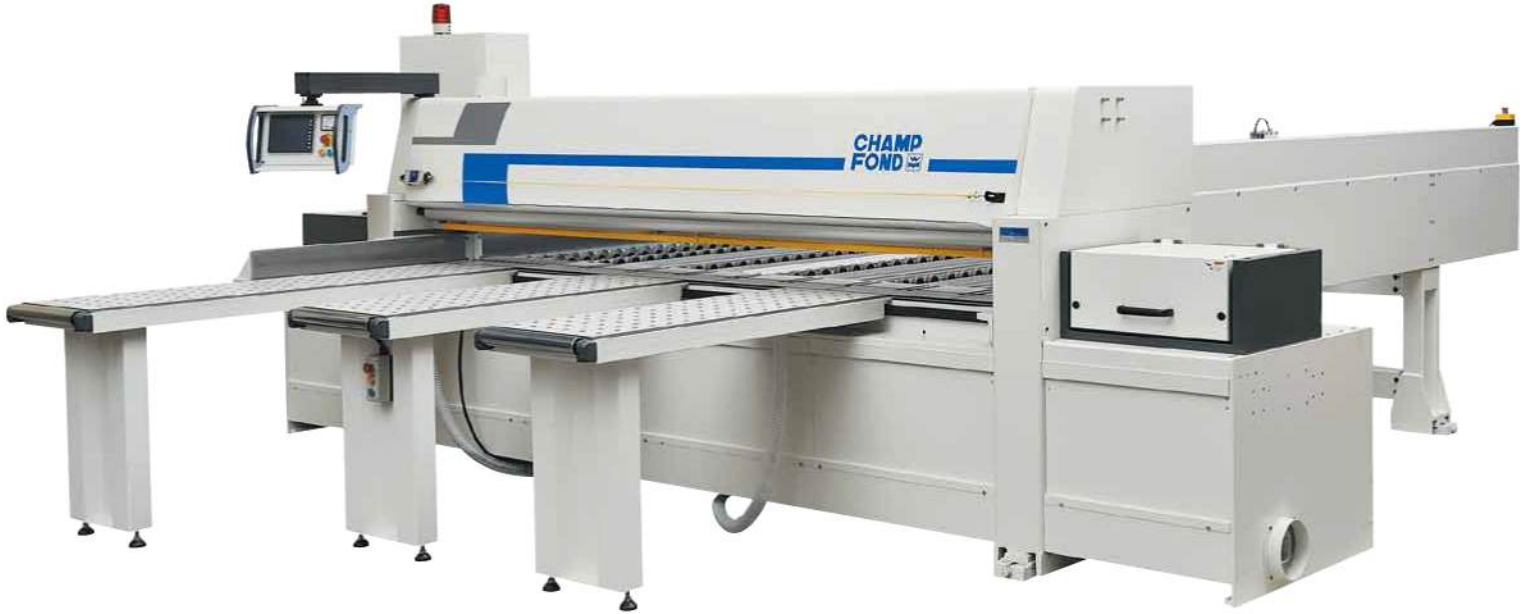
Picture shown model no. HS-135 / 3231 with optional floating tables 2.1M x 1 + 1.5M x 2 air blower x1.