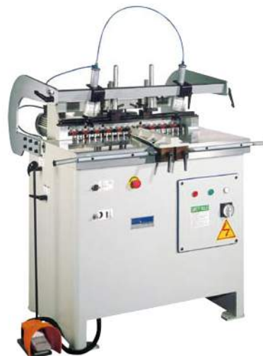
LB-21i/27i/35Bi 單排鑽孔機 Single Line Boring Machine